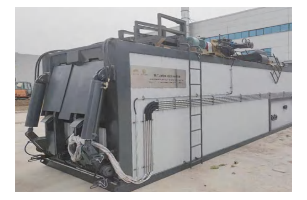
Hydraulic Drummed Bitumen Decanter in Uzbekistan Tashkent, uzbekistan, handles 300 tons of bitumen in bags January 21th, 2020