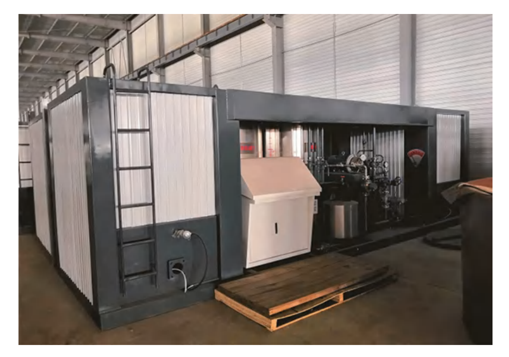
Bitumen Emulsion Plant in Peru Cusco, Peru, treated 200 tons of asphalt to build roads July 18th, 2019