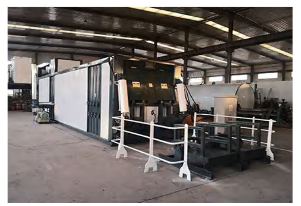
Bitumen Melting Machine/Bitumen Decanter in Nigeria Lagos, Nigeria, handles 800 barrels of asphalt January 03th, 2020