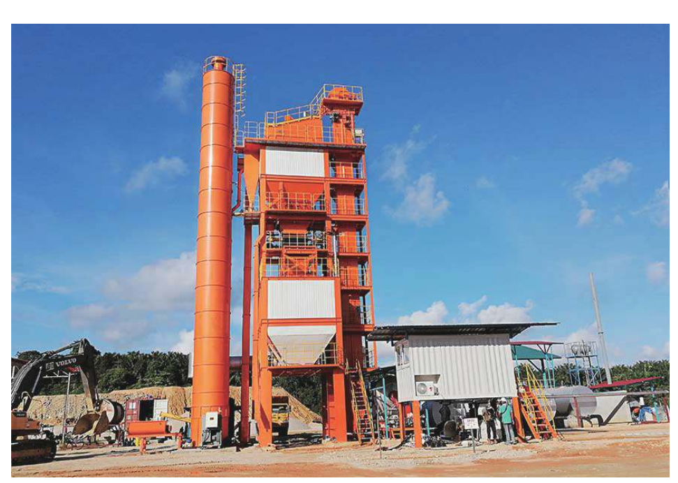
120TPH Asphalt Plant in Malaysia Won Client's Praise