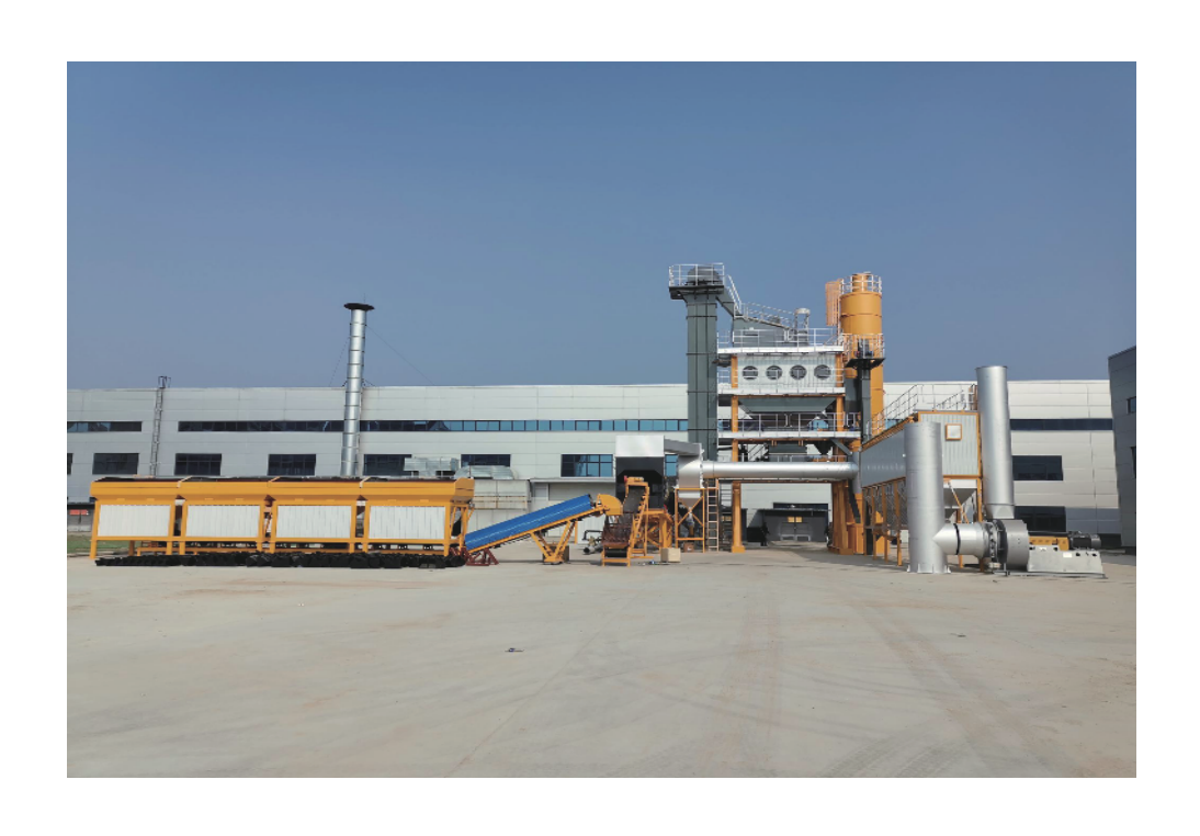
LB Asphalt Batch Mixing Plant in Nigeria