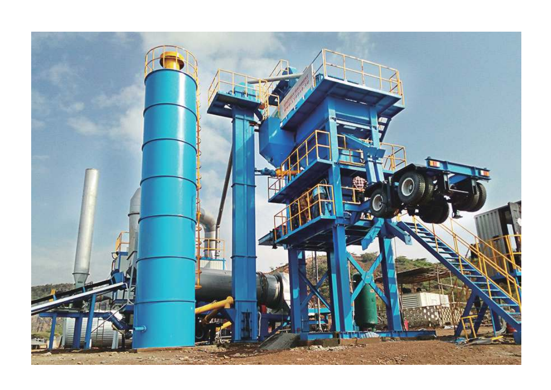
YLB700 Mobile Asphalt Mixing Plant in Ethiopia