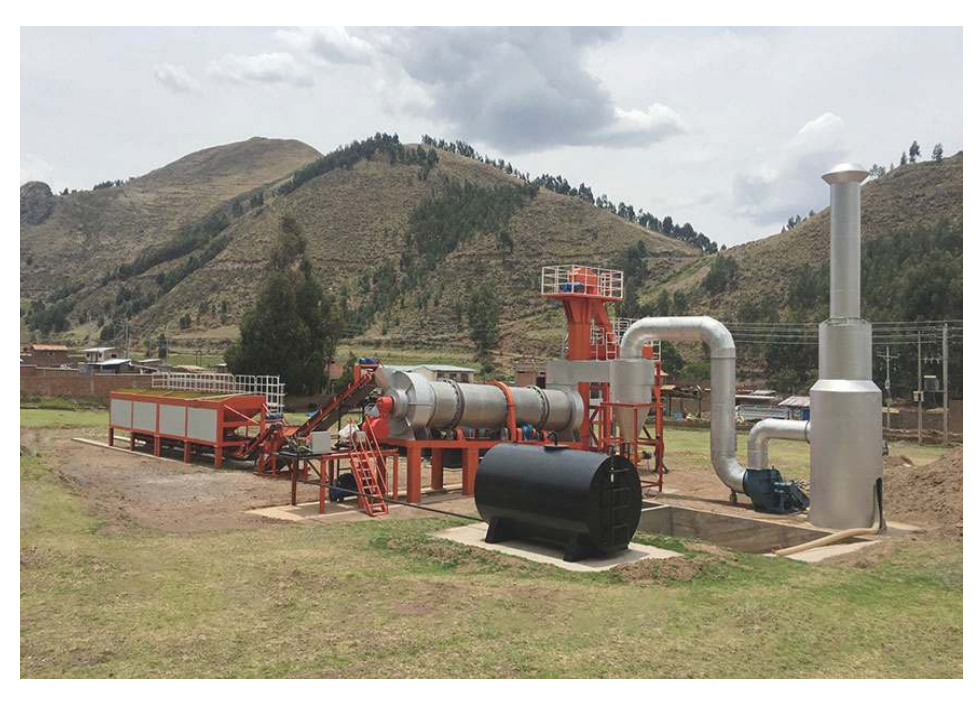
DHB80 Continuous Asphalt Mixing Plant Erected in Peru