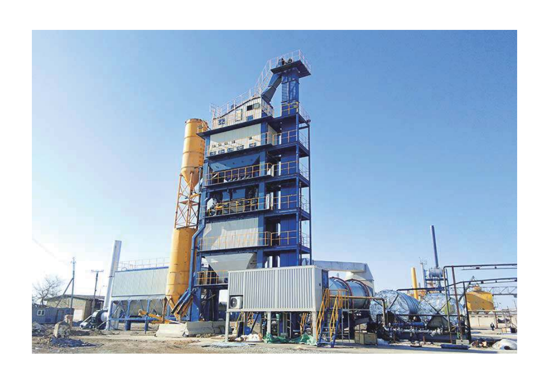
240TPH Asphalt Batch Mix Plant Running Smoothly in Uzbekistan