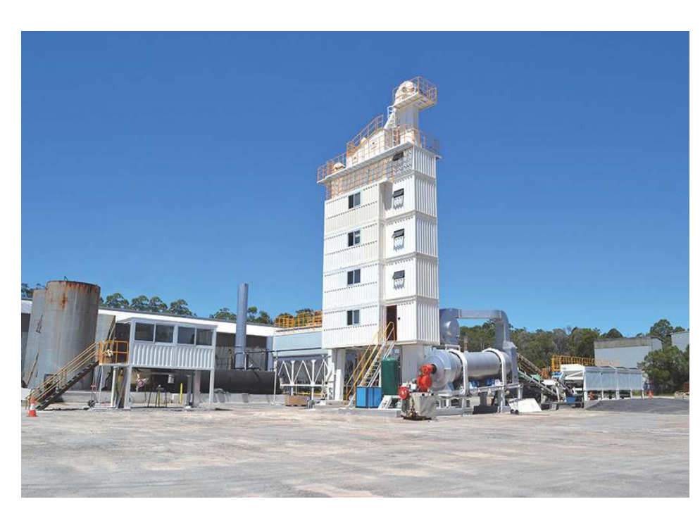
ELB1500 Environmental-friendly Asphalt Mixing Plant in Australia